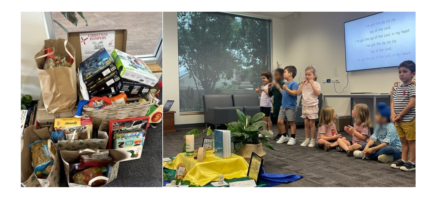
St John Bosco School Class of 2023