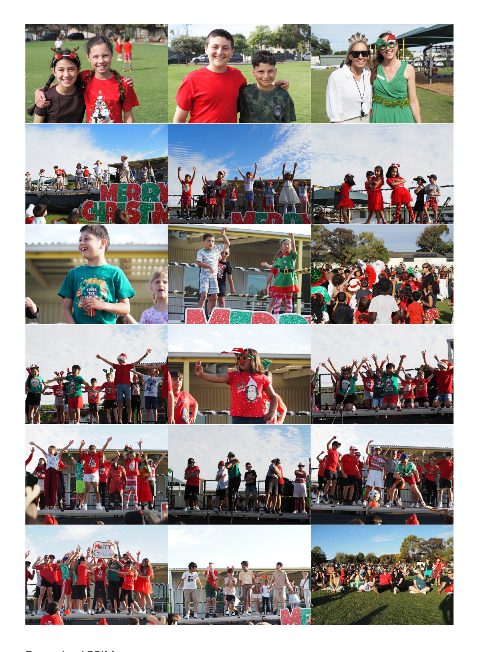
From the APRIM