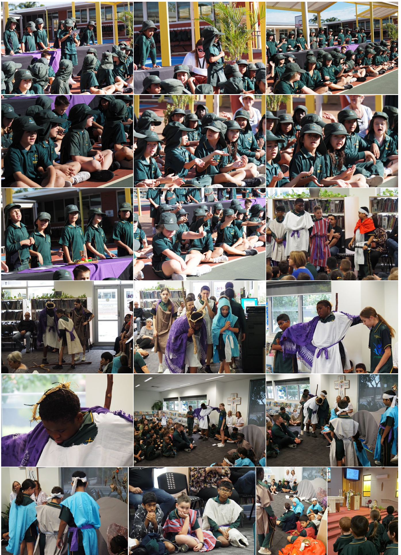
From the APRIM