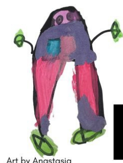
Art by Anastasia